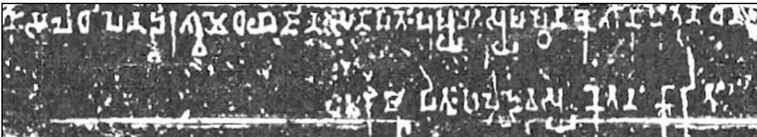
Dhanadeva Ayodhya inscription, 1st century BCE, earliest written Sanskrit, in Brahmi script