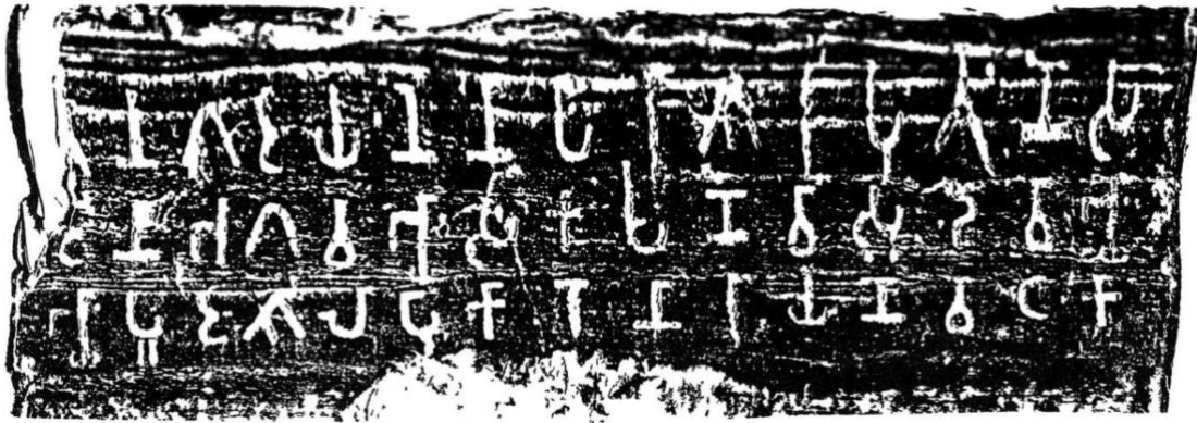
Hathibada Ghosundi Inscription, 2nd century BCE, earliest written Sanskrit, in Brahmi script

the pith of the Vedic tradition to-come, was composed in Old Sanskrit over a period of a few hundred years and may have been completed by 1500 BCE. Why and how this ever-evolving, adaptive, innovative poetic tradition stretching back perhaps thousands of years to the Eurasian Steppe was then compiled and capped is a story in itself. This standardization process is believed to have been completed by the end of the second millennium BCE. Although there may have been attempts to write down the Vedas towards the end of the first millennium BCE (the earliest known Sanskrit writing in the Brahmi script dates to the 1st or 2nd century BCE, and the record of the Brahmi script itself begins with the Ashokan inscriptions of the 3rd century BCE) the hymns were probably not committed to writing until the Gupta period (fourth to sixth century CE) when the Brahmi script was widespread. The oldest surviving Rgvedic manuscript dates to the eleventh century CE.