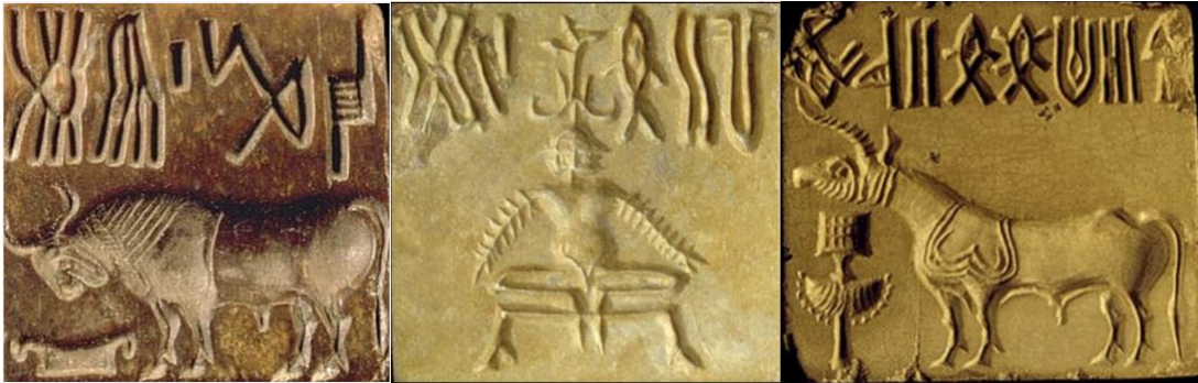
3rd millennium BCE Harappan Script prior to Vedic peoples' migration to the Indus Valley